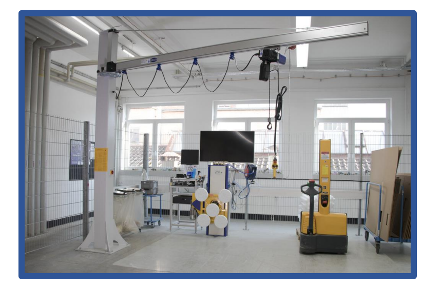
Jib Crane & Hoist