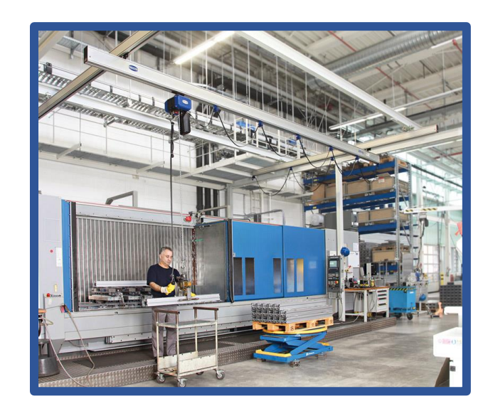
Cantilevered Track & Hoist